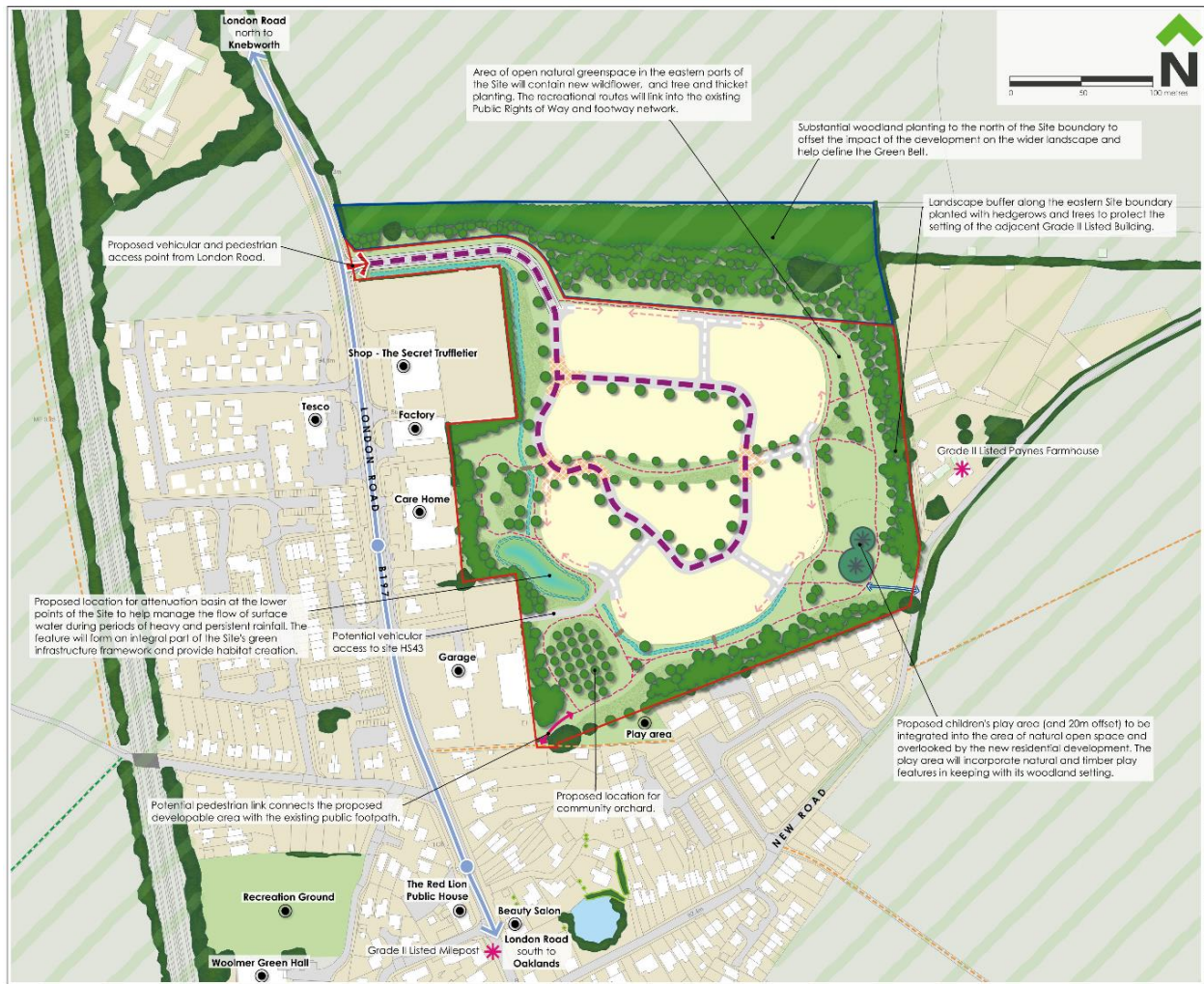
© CSA Landscapes Ltd. Do not scale from this drawing. Refer to figured dimensions only.

An outline planning application has been submitted for the development of the former Green Belt site for 150 dwellings to include affordable housing, public open space, landscaping, sustainable drainage system (SuDS) and vehicular access points. The Parish Council has objected to this citing the significant flooding risk and concerns regarding road access.